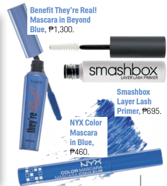
Benefit They're Real! Mascara in Beyond Blue, ₱1,300.