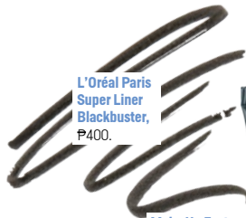
L'Oréal Paris Super Liner Blackbuster, ₱400.

Modernize tried-and-true makeup to keep your look anything but mundane.