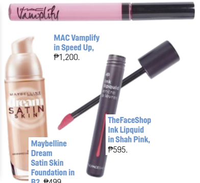
MAC Vamplify in Speed Up, ₱1,200.