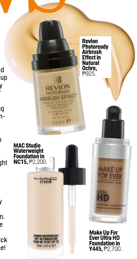
Revlon Photoready Airbrush Effect in Natural Ochre, ₱925.