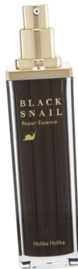
Endocare Ampoules, ₱2,600 for 7-pack.