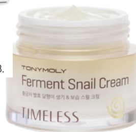
Tony Moly Timeless Ferment Snail Cream, ₱2,198.