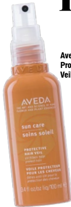
Aveda Sun Care Protective Hair Veil, P1,700.