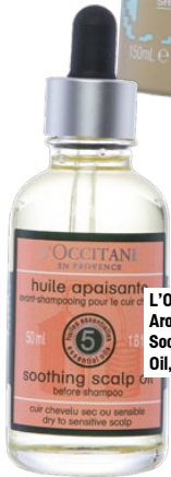
L'Occitane Aromachologie Soothing Scalp Oil, P2,100.