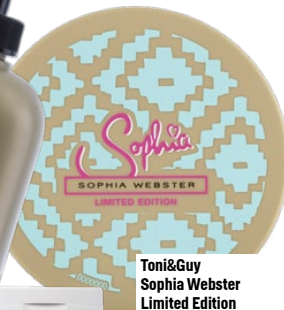
Toni&Guy Sophia Webster Limited Edition Volume Plumping Whip, P1,099.