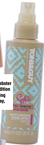
Toni&Guy Sophia Webster Limited Edition Moisturizing Shine Spray, P849.