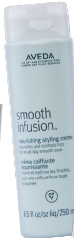
Aveda Smooth Infusion Nourishing Styling Cream, P1,900.