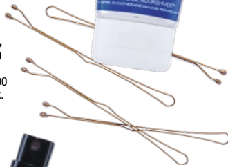
Goody Start, Style, Finish Bobby Pins in Gold, P100 for 18-pack.