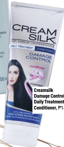
Creamsilk Damage Control Daily Treatment Conditioner, P140.