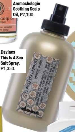
Davines This Is A Sea Salt Spray, P1,350.