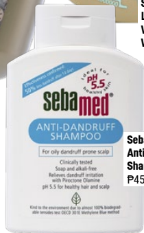
Sebamed Anti-Dandruff Shampoo, P458.