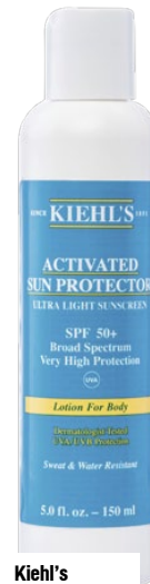
Kiehl's Activated Sun Protector SPF 50+, P2,215.