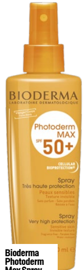
Bioderma Photoderm Max Spray SPF 50, P2,034.