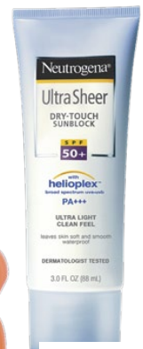
Neutrogena Ultra Sheer Dry-Touch Sunblock SPF 50, P525.