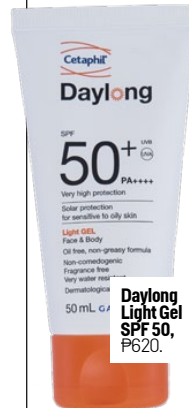
Daylong Light Gel SPF 50, P620.