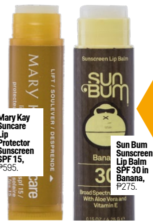
Mary Kay Suncare Lip Protector Sunscreen SPF 15, P595.