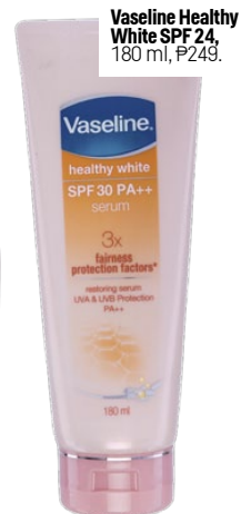
Vaseline Healthy White SPF 24, 180 ml, P249.