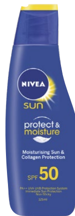
Nivea Sun Protect & Moisture SPF 50, 125 ml, P459.