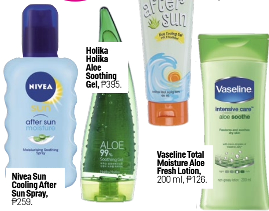
Nivea Sun Cooling After Sun Spray, P259.