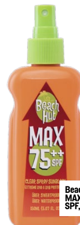
Beach Hut MAX 75+++ SPF, P549.