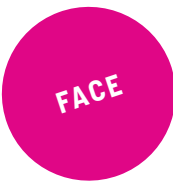
Avène Crème SPF 50 For Dry Sensitive Skin, P1,600.