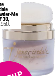
Jane Iredale Powder-Me SPF 30, P1,950.

"Ultraviolet rays can easily pass through clouds. Rays reflect off concrete, sand, water, and snow—so one can even burn while in the shade. UV rays also penetrate car windows and every day clothing. Applying window tints in your car (in addition to using sunscreen) may provide further protection." —Dr. Jaime P. Nunez, JKN Skin & Surgery Specialists