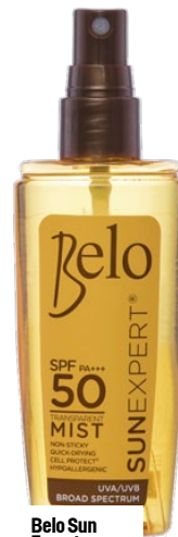
Belo Sun Expert Transparent Mist SPF 50, P480.