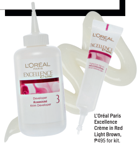
L'Oréal Paris Excellence Crème in Red Light Brown, P495 for kit.

“You can never start too early—as long as you do it correctly. No matter how young you are, I recommend wearing SPF 30 daily, moisturizing every night, and wearing sunglasses when outdoors. I started using anti-agers containing retinol at 18. It's important to start with the smallest dosage of retinol in your 20s; you can work your way up to higher concentrations in your 30s and 40s.”