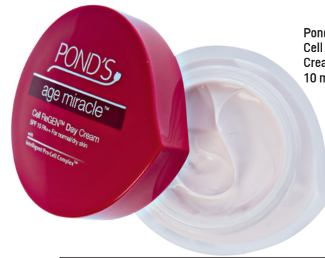
Pond's Age Miracle Cell ReGen Day Cream SPF 15, 10 ml, P99.