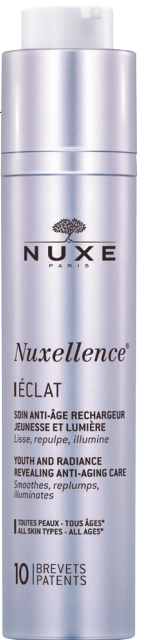
NUXE Nuxellence Eclat, P2,750.